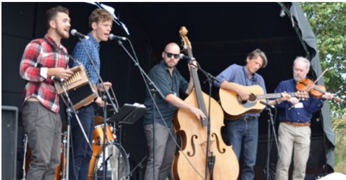
Alligator Gumbo played traditional and self-written Cajun music in a way that is true to tradition. The vocals was sung in Louisiana French.