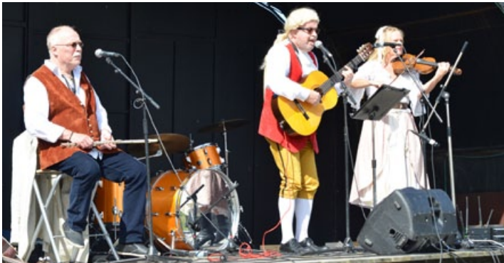
Bellman, Winblad & Movitz was playing music by Carl Michael Bellman the Swedish National poet and troubadour from the 1700s.