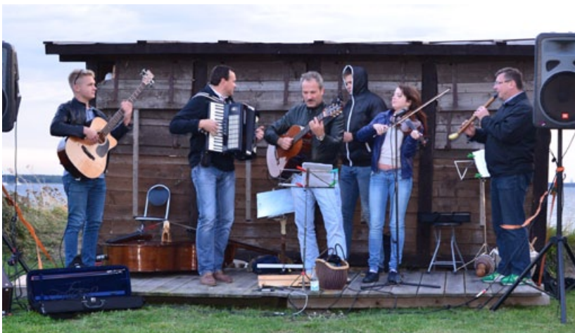
Grupė Karčema from Lithuania were inspired and played some of their own songs.