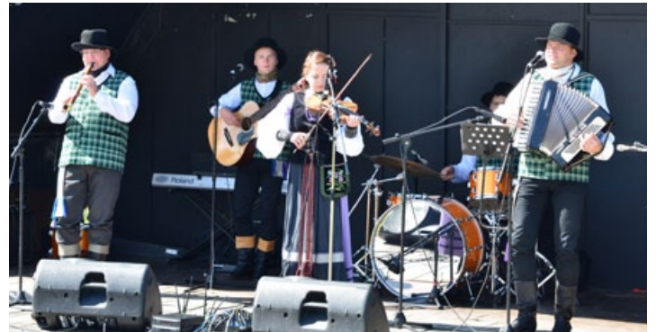
Grupė Karčema, in addition to their own songs, the band played well-known Lithuanian popular songs and classics.