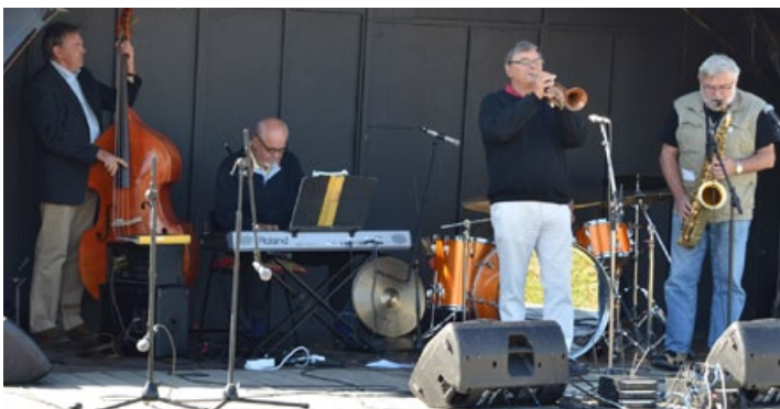
JazzCaptains played music derived from the 20/30's and can be called happy jazz or swing with many well-known songs