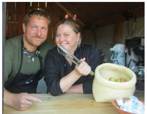
For those who did not have their own picnic food could buy food from Ragnar and Kinn.