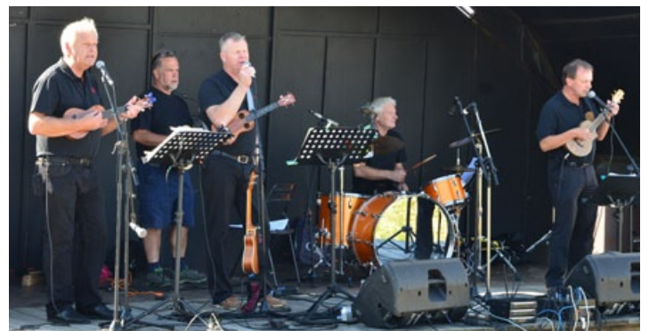
The Ukulele Orchestra of Sweden played popular pop and rock songs from the 60's 70's, but on the ukulele.