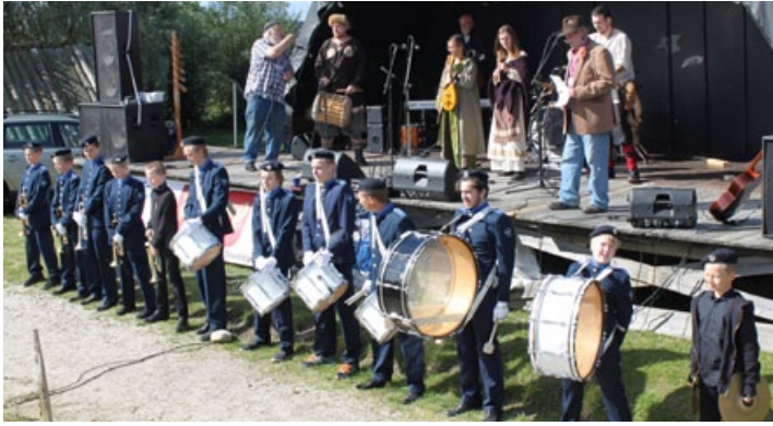
Vellinge Music Corps opened the festival when they came marching from Höllvikens library followed by .....