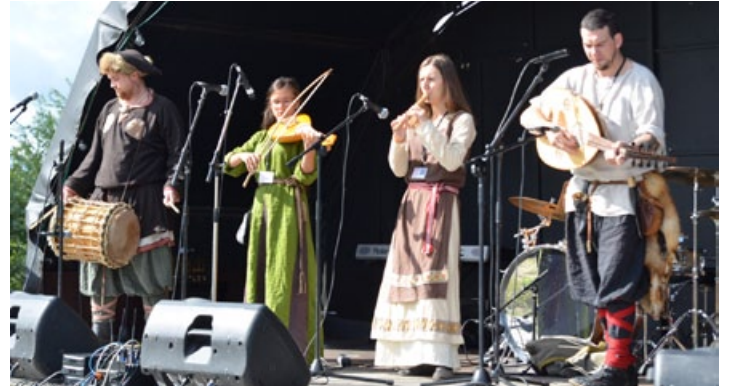
Grupa Radnyna playing medieval music from Eastern Europe.