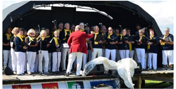
Taube Choir in Scania was singing songs of our Swedens most beloved national poet, Evert Taube, the poet who invented the Swedish summer.